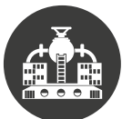
Planning and Change Leaders