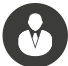
COOs, CEOs, VPs, Presidents, MD's